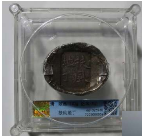
槽錠 "Groove Ingot"