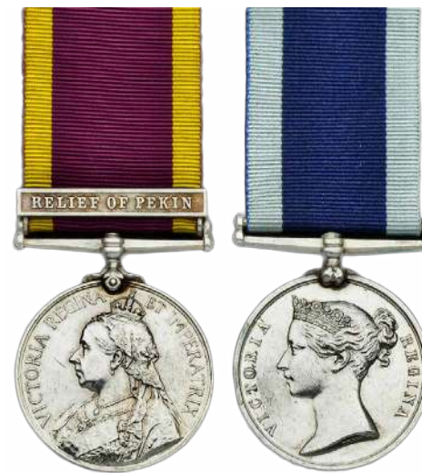
The 1900 medal with clasp, and naval Long Service medal 1900年獎章

有鑄上受頒者姓名，但卻發現被私下刻上受頒者資料；而頒予軍隊及印度海軍的獎章則以機器壓上姓名。另外還有一款罕見的飾條「中國1842」，給予已於1842年受勳的軍人，讓他們扣在之前獲頒的勳章上，直至後來才發現1842年的勳章的扣環未能扣上飾條！這款飾條產量約有100個。