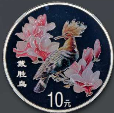
10 Yuan 1999. Extremely rare. Only few pieces known. Proof in NGC-plasticholder PF 68 ULTRA CAMEO.