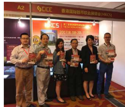
📍 北京, Beijing 2017 China International Coin Expo (Beijing) 2017(第三屆)中國國際錢幣(北京)展 銷會(CICE)