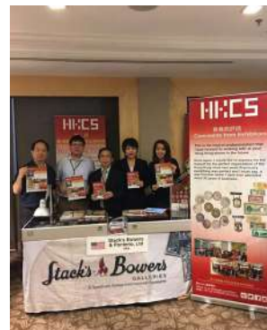
📍 吉隆坡, Kuala Lumpur Trigo Kuala Lumpur Money Show 2017 2017吉隆坡錢幣展