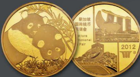
5 Ounces 2012. Extremely rare. Only 99 pieces struck. With original case, original sealed and with original certificate. Proof.