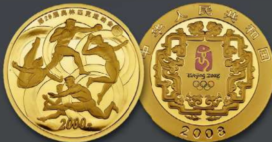
2,000 Yuan 2008. Very rare. Only 2,000 pieces struck. In a wooden pedestal with a jade dragon on it, with original certificate. Proof.