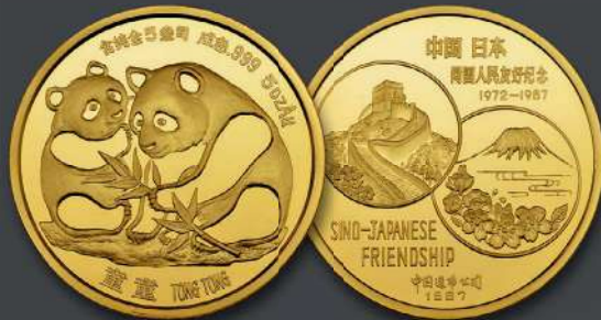
5 Ounces 1987. Very rare. Only 1,500 pieces struck. With original case and original certificate. Proof.