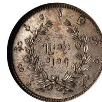
5 Mat 1/2緬元