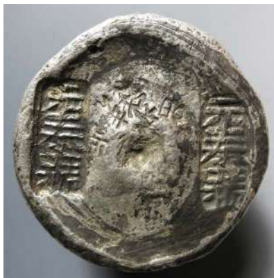
蘇坨 " Su Tuo "