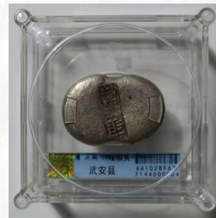
腰錠 " Waist Ingot "