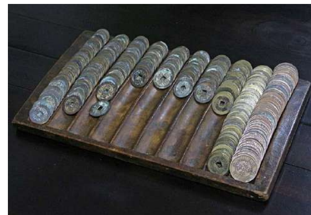
木質錢幣託盤 Coins Wood Pallet

在黃聲波國際商貿城和收藏品市場個人藏館中，我見識了他多年來的錢幣、銀錠和雜項的收藏，但體會更深的是他收藏理念的體系與細節，這在錢幣圈極為難得。從個人藏館的整體布局與細節搭配，錯落有致卻又井井有條，可以看出黃聲波獨特而細膩的審美與品位。相信這也與他收藏錢幣的過程中，用心研讀相關書籍來增加知識密不可分。