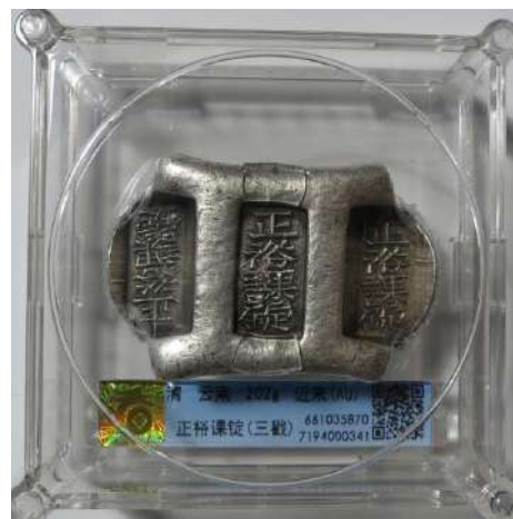
牌坊錠 "Arch Ingot"

Moreover, the density of silver is less than gold, so it is softer than gold, but it is not feasible to use the teeth to test the authenticity as shown in drama. In fact, if you want to spend money, first check the fineness and weight it. Breaking the silver into the parts, merchants usually used shears, weight it with small scale, similar way as "Chu Ying yuan" (The earliest primitive coinage of gold in China)