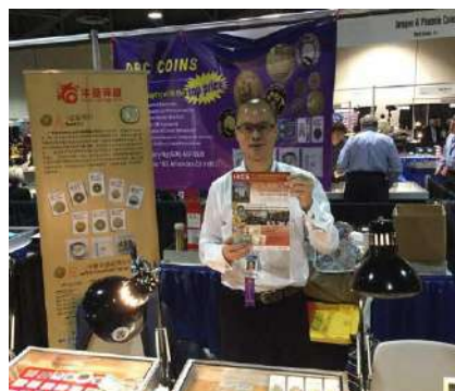
📍 美國, USA Long Beach Expo 美國長灘錢幣展覽會