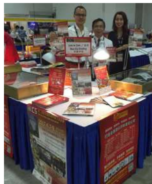
📍 新加坡, Singapore Singapore International Coin Fair 2017 2017新加坡國際錢幣展銷會