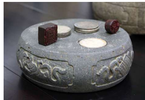
錢莊試銀石 Silver Test Stone

不知什麼時候開始，來自廣東、福建的功夫茶也在浙江盛行起來，過去十多年，黃聲波不間斷收藏了