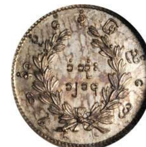
1 Mat 1/10 緬元

The missing denomination was 1/16 Kyat or 1 Pe. This was adopted in 1889 and the coin is difficult to obtain. The dies were purchased from Calcutta and coins were struck in the Mandalay Mint in 1889.