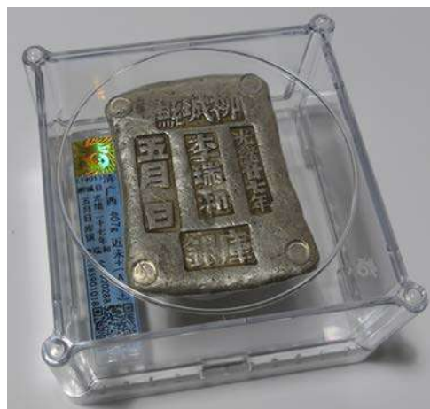
砵碼錠 "Weight Ingot"

從金銀流通來說，明清時期，民間主要的流通貨幣仍是錢（銅錢），金銀錠走的官商途徑，一般有五兩、十兩、五十兩之分“官途”很簡單 - 為稅賦徵收