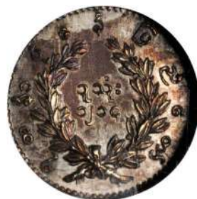
1 Mu 1/8緬元