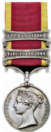
Obverse of Taku Forts 1860 「大沽口炮台」1860獎章正面

這場戰爭頒發的銀章與1842年的設計和勳帶大致相同，有些銀章配有各種飾條，鑄有「廣州1857」、「佛山1857」、「大沽口炮台1858」、「大沽口炮台1860」及「北京1860」，頒發予英國及印度各軍事單位。飾條呈罕有的魚尾型，這種設計亦用於「印度兵變」獎章。皇室海軍和海軍陸戰隊的勳章未