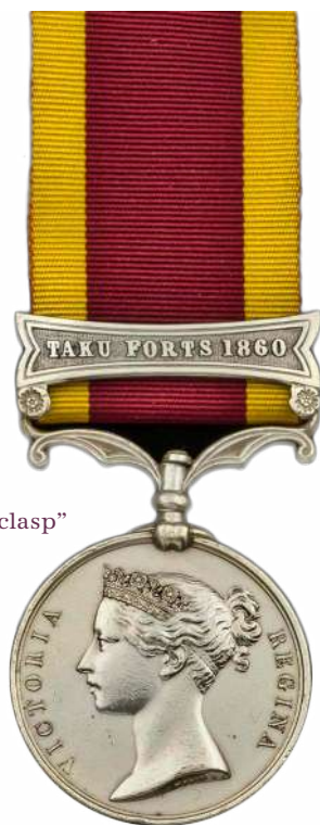
The “fishtail clasp” 魚尾形飾條

After a severe action in 1842, the Chinese finally conceded defeat and submitted to the Treaty of Nanking. This involved payment of a huge indemnity of 21,000,000 dollars, famously ceded Hong Kong Island to Great Britain and established five ‘treaty ports’ (Shanghai, Canton, Ningpo, Fuchow and Amoy) in which British merchants were given distinct trading concessions.