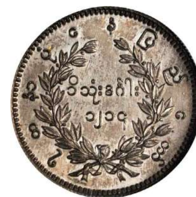
1 Kyat 1 緬元