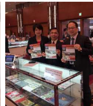
📍 東京, TOKYO 2017 Tokyo Interna- tional Coin Conven- tion (TICC) 2017東京國際錢幣展銷會