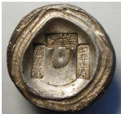
饅頭錠 " Steamed Bun Ingot "