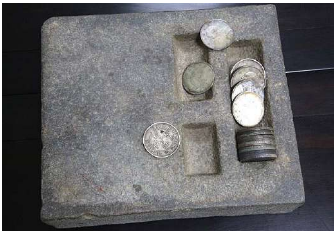
錢莊試銀石 Silver Test Stone

since 2008, he went to Beijing to attend the auction of Guardian and Chengxuan, and since 2009, he started to go to the auctions happened in Hong Kong at April and August every year.