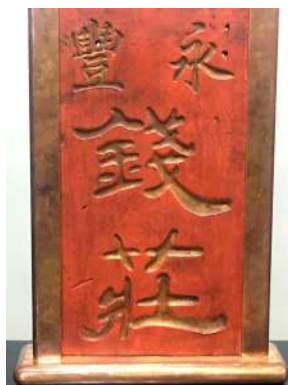
(上至下)舊時錢莊招牌及門口裝飾 (Top-down) Old Chinese Private Bank Brand Plate & Gate Decoration

Yiwu International Trade Market is the core of Yiwu Economy. The shopkeepers here are all able to speak English, and we can see many kinds of people who speak different languages and from different races. Moreover, from this place, people can find any necessity that they want and also these goods are export. The folks guided us said, if you spend only 1 minute in each store, it will take you a year to shop the whole market. "Quan Bi She" is lying here, which is keeping quiet in a noisy neighborhood, as his owner's character.