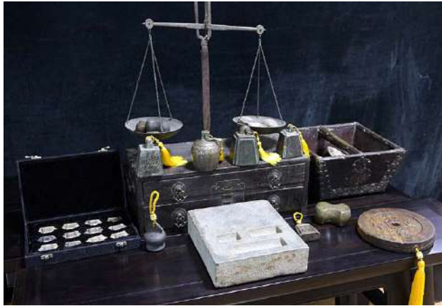
錢莊常用工具 Common Tools