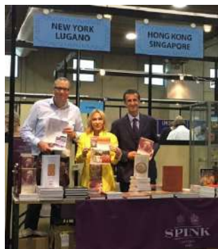
📍 意大利, Verona, Italy VERONAFIL 2017 2017維羅納錢幣及郵票展