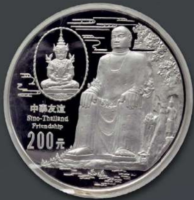
200 Yuan (1 kg silver) 1997. Very rare. Only 680 pieces struck. In a nice wooden case, original sealed and with original certificate. Proof.