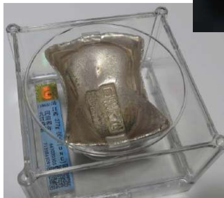
鏡面錠 "Mirror Ingot"

的銀錠還會印上工匠的名字，即工匠要對每一枚錠子負責。造型的不同就像今天各地有各地的方言，但價值的判斷則要看銀子的成色與重量，所以對工匠來說，其造假也意味著刀直接架在了脖子上。